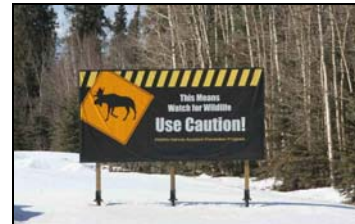
Km 135 Alaska Hwy