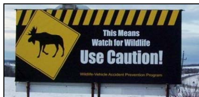
Highway 97 north

East Kootenays – Deer Style. During 07/08, the billboard alternated between 2 locations – Highway 3 east of Fernie and Highway 93/95 south of Fairmont Hot Springs.