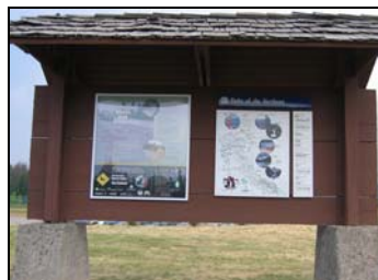
Highway 16/97 Junction