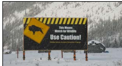
Near Iron Creek, Alaska Hwy

Using the WCPP billboard design, Public Works and Government Services Canada has placed two Moose style billboards and two Bison style billboards along the BC portion of the Alaska Highway in high risk collision areas.