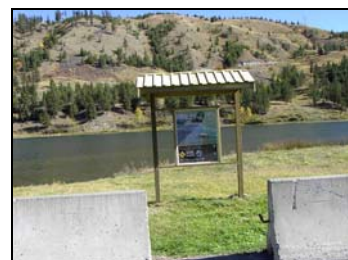
6 Mile Lake