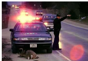
Use Caution While Driving!

Use Your Vehicle - Clean and align vehicle headlights. Keep your windshield clean. Honk your horn to startle wildlife off the road. Use high beams and scan the road ahead with quick glances.