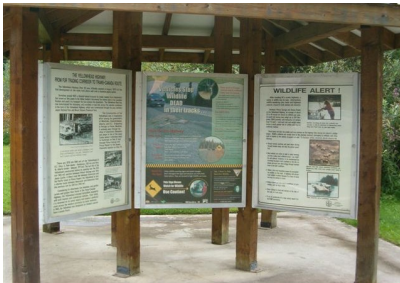
Rest stop sign at Slim Creek

Priority projects for WCPP are locating billboards along high risk stretches of highway and placing signs in rest stops. Billboards reinforce traditional wildlife warning signage, while rest stop signs provide detailed information for drivers.