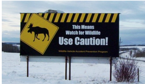
Billboard near Dawson Creek